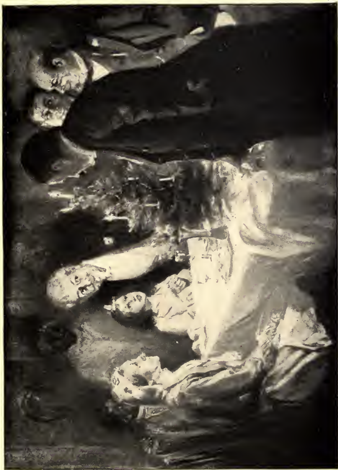
Each guest had a candle alight.